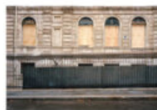
16. Avenue de la République