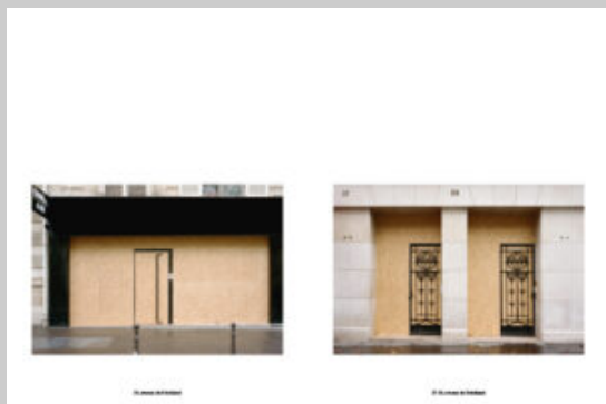
14. Avenue de la République