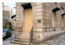
13. Avenue de la République